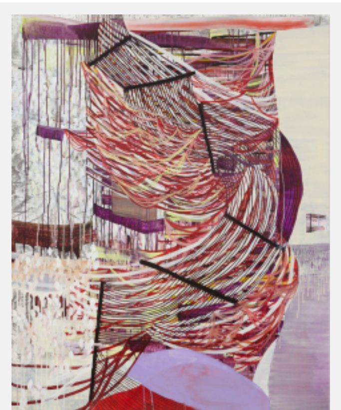
Sway (purple), Graphite, fluid acrylic and ink on yupo, 60"x48", 2015

Not really- I've been an art teacher in several capacities since 1991. I've taught art to young children, teens and adults in private, group and mixed age settings including outreach for high risk youth, preschool and after school enrichment, art school, and museum classes. However, my studio practice has always been my primary focus.