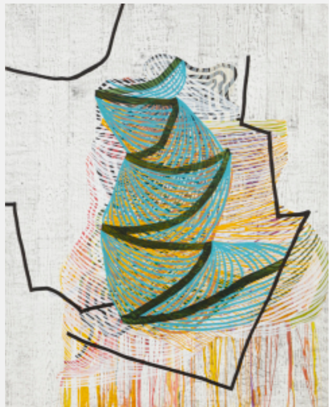
Pining, Graphite, fluid acrylic and ink on yupo, 60"x48", 2014

Posted on August 10, 2015 by 365Artists/365Days